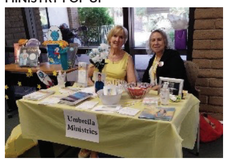
EAST COAST CONFERENCE