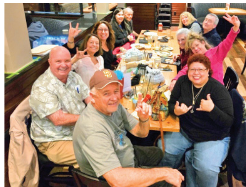
SAN DIEGO NORTH: COUNTY CHRISTMAS GATHERING

Check out the Umbrella Website for resources of meeting in your area. https://www.umbrellaministries.com/resources-2295/