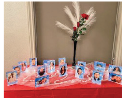
MOMS MEMORY BOARDS