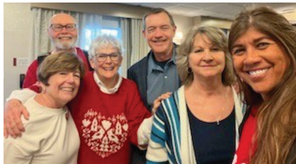
SAN DIEGO NORTH: COUNTY DINNER